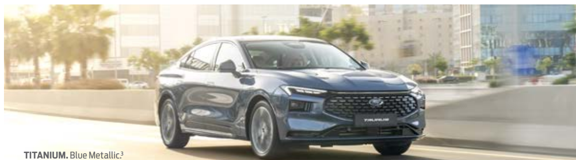
TITANIUM. Blue Metallic 3