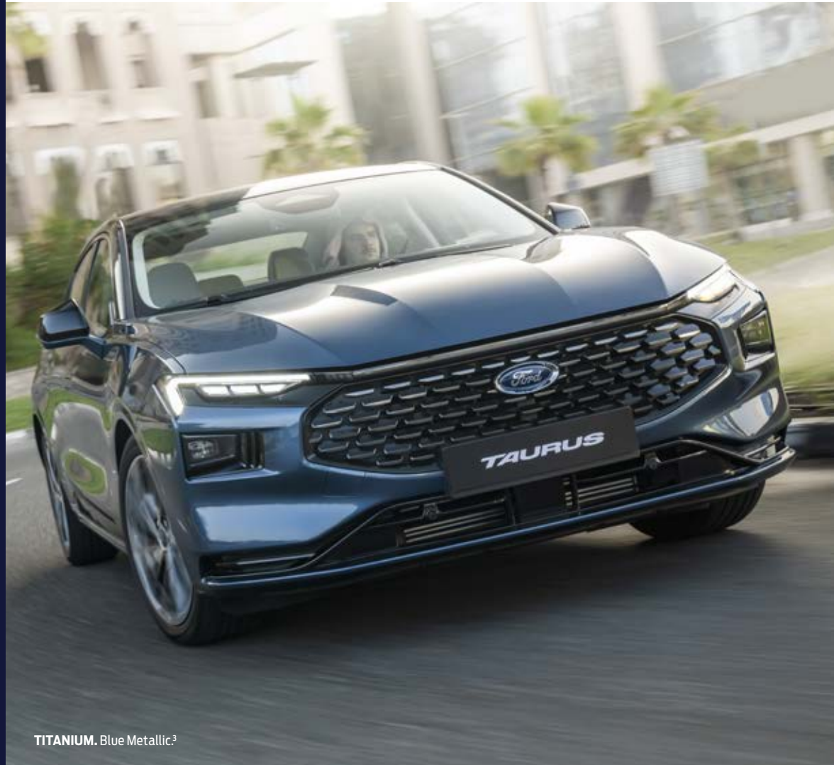
TITANIUM. Blue Metallic. 3

1. Horsepower and torque ratings based on premium fuel per SAE J1349® standard. Your results may vary. 2. Remember that even advanced technology cannot overcome the laws of physics. It's always possible to lose control of a vehicle due to inappropriate driver input for the conditions. 3. Additional charge.