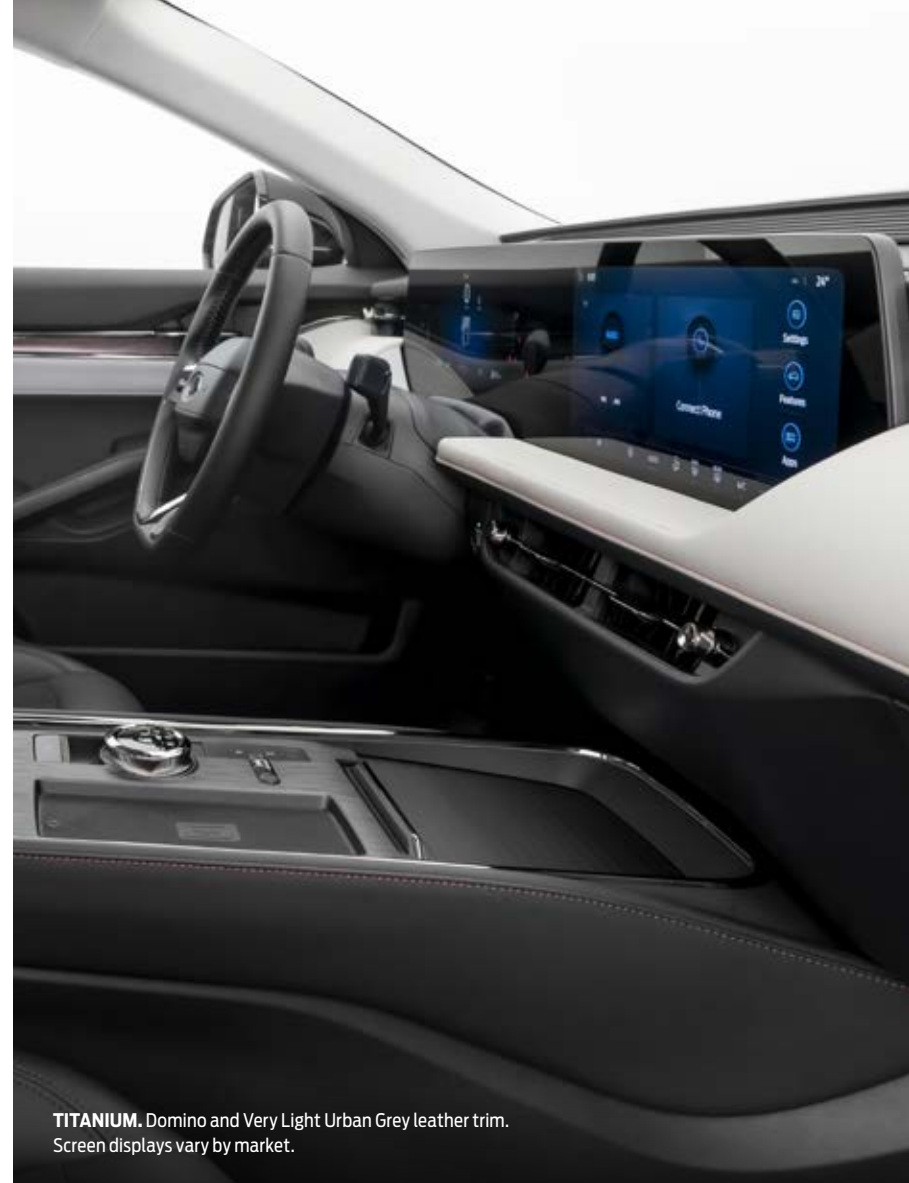
TITANIUM. Domino and Very Light Urban Grey leather trim. Screen displays vary by market.

The Ford Taurus sedan brings the spirit of excitement to the everyday driver. SYNC® 4 provides fast and simple access to your audio sources and lets you interact with select mobile apps while keeping your eyes on the road. Voice commands, steering wheel buttons, or a quick tap on your 13.2" touchscreen will give you control of your compatible mobile apps. Connect your compatible iPhone® with Apple CarPlay® 1 to give you access to Apple Music® and use Siri® to send and receive hands-free text messages. 2 If you have a compatible Android™ phone, Android Auto™ 3 connects to Google Maps™ and the Google Assistant™ personal assistant for pass-through voice commands. The available Wireless Charging pad is located in the center console and it allows you to charge your smartphone without a cord. The Taurus brand supports Qi wireless charging protocol. 4 And the Rotary Gear Shifter enables you to take control of the eight-speed automatic transmission with the simple turn of the dial.