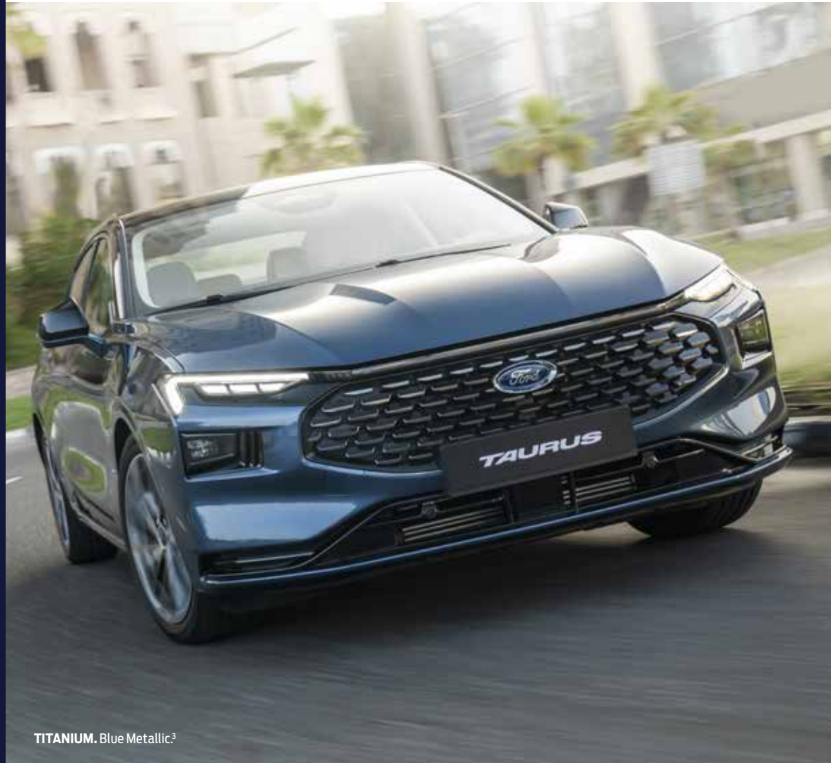
TITANIUM. Blue Metallic. 3

1 . Horsepower and torque ratings based on premium fuel per SAE J1349® standard. Your results may vary. 2 . Remember that even advanced technology cannot overcome the laws of physics. It's always possible to lose control of a vehicle due to inappropriate driver input for the conditions. 3 . Additional charge.