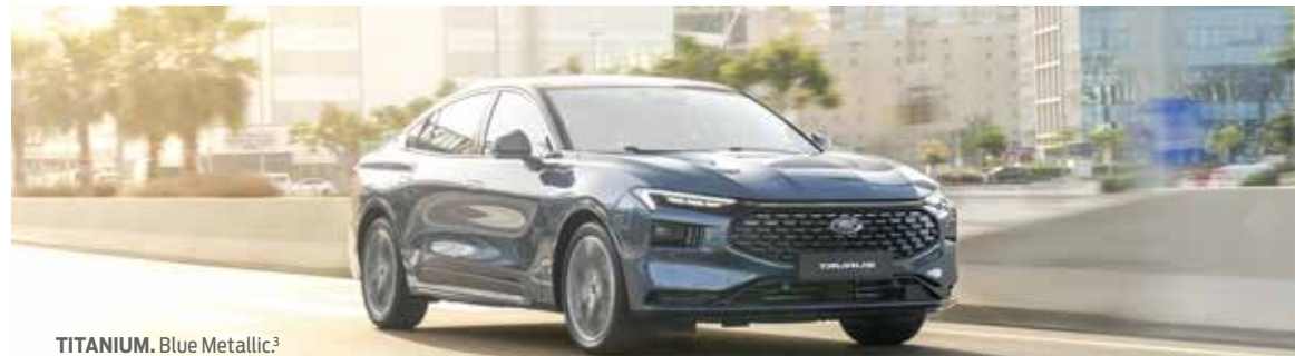
TITANIUM. Blue Metallic 3