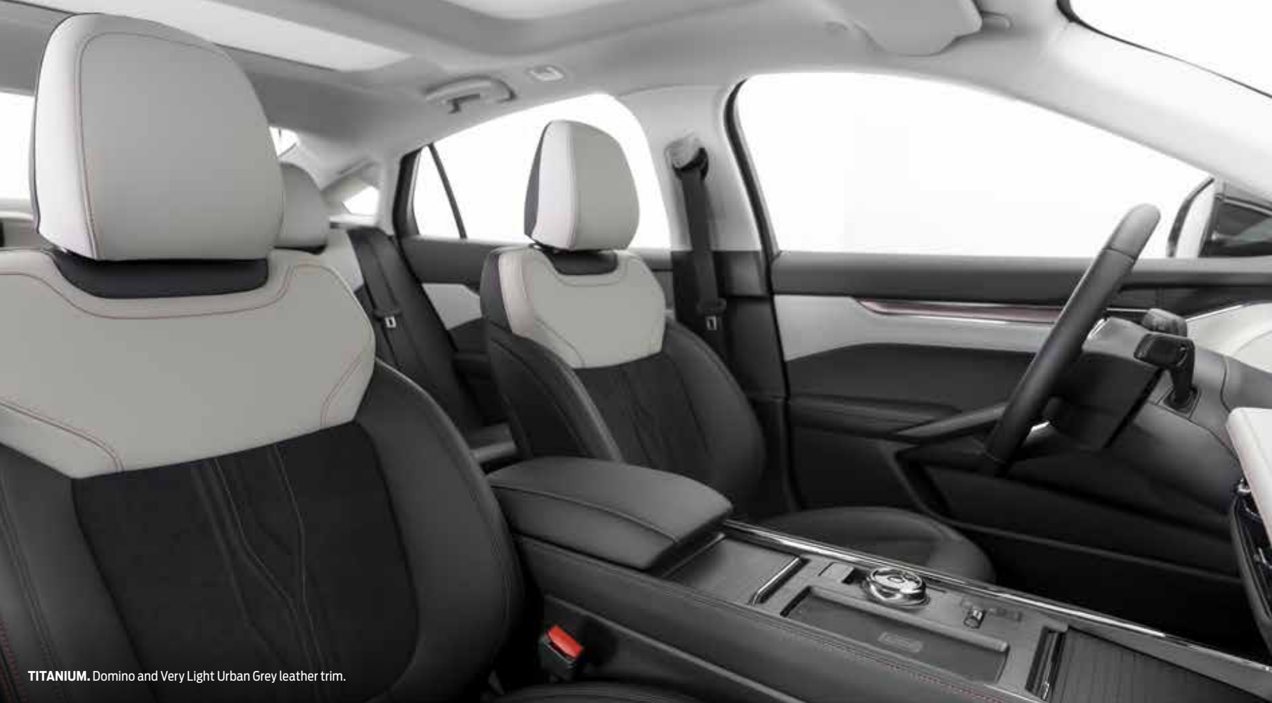
TITANIUM. Domino and Very Light Urban Grey leather trim.